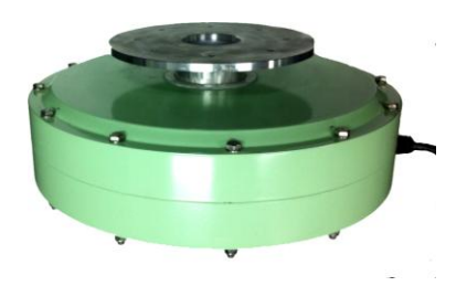
Polar Wind Generator - 1